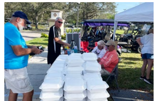
275 SFC Brats Combos Sold at Mardi Gras Street Party