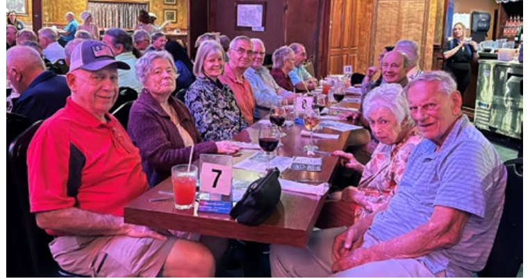
It was a fun night at Capone’s Dinner Show in February!