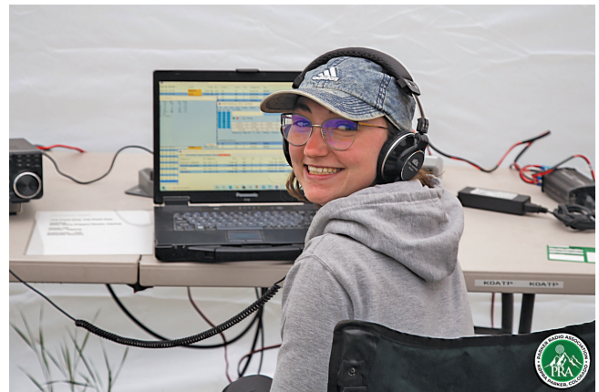
During the 2021 ARRL Field Day, an unlicensed camper from a nearby campground visited the Parker Radio Association's, K0PRA, event location in Colorado, to learn more about the event and ham radio.