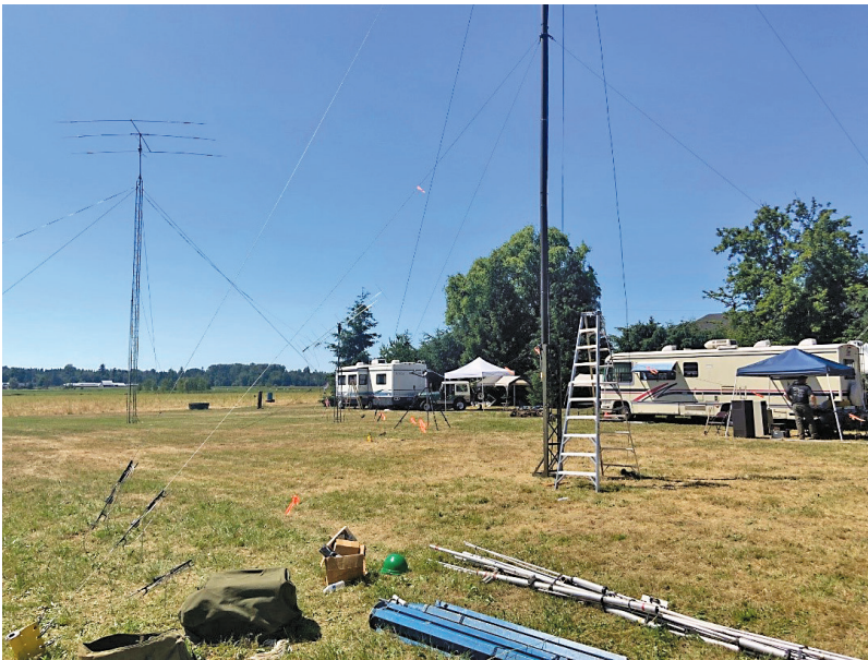
The antenna setup for the Whatcom Emergency Communications Group, W7ECG, at their location in Everson, Washington, during the 2021 ARRL Field Day.