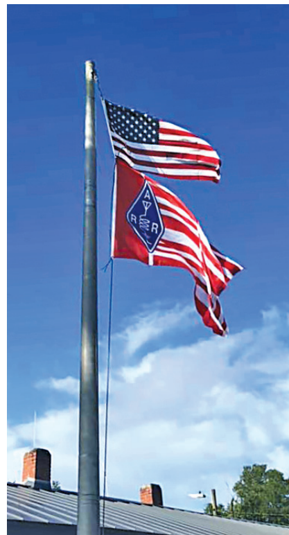
US and ARRL flags were prominently displayed at the 2021 ARRL Field Day location of the East Pasco Amateur Radio Society, K4EX. They set up their station at the San Antonio Railroad Depot Museum in San Antonio, Florida.

Newark Ohio ARA N8ARA 121 2 25 1,292 OH Elkhorn Valley ARC W0OFK 209 2 30 1,194 NE San Luis Valley ARA K0SLV (+NA0ED) 78 2 12 1,166 CO Jacksonville ARS K9JX 29 2 10 1,136 IL Central New York ARC N2CNY 119 2 4 1,088 WNY Saginaw Valley ARA K8DAC 104 2 12 1,080 MI Elmira ARC VE3ERC 178 2 5 1,014 ONS Lake Oswego ARES WA7LO 32 2 10 1,014 OR Kern Co. Central Valley ARC W6LIE 30 2 4 1,010 SJV Red River Valley ARC W4W 175 2 15 1,000 NTX Maxim Integrated Beaverton & Friends N7QJ 183 2 8 958 OR North Hills RC K6IS 185 2 25 860 SV Plano AR Klub K5PRK 93 2 9 846 NTX Grundy Co. ARC W9G (+KB9SZK) 18 2 6 806 IL Stillwater ARC (OK) K5SRC 44 2 12 760 OK Eastern Ozarks ARC K0EOR 46 2 5 234 MO Maple Ridge ARC VA7SGY 11 2 4 172 BC Peace Country ARC VE6ARC 58 2 4 166 AB